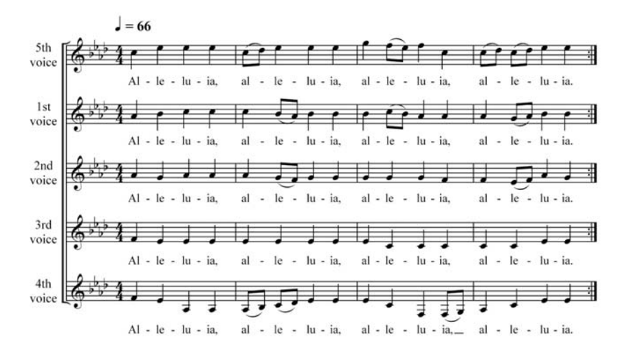
Figure 12. Stephanie Martin, Alleluia , mm. 1−4. © 2012 Cypress Choral Music. Used by permission.