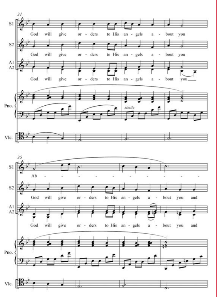
Figure 7. Sarah Quartel, Snow Angel III, mm. 31–38. © 2002 Sarah Quartel. Used by permission.