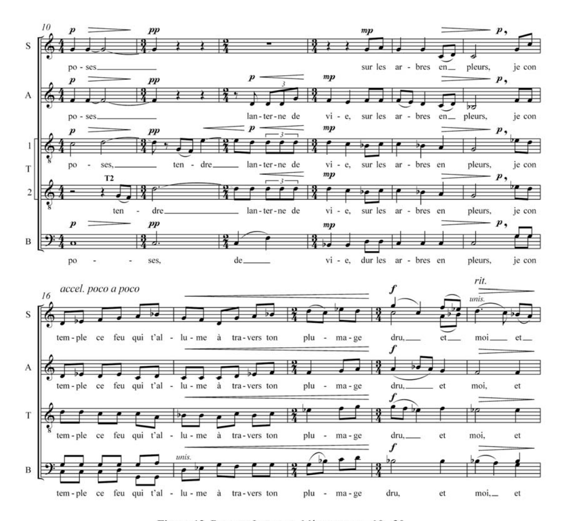
Figure 13. Ramona Luengen, Mésange , mm. 10−20. © 2013 Cypress Choral Music. Used by permission.

Luengen's "Mésange," published in 2013 by Cypress, is one of her more recent compositions for the advanced mixed choir. The French poem penned by Rainer Maria Rilke contemplates the extraordinary of a rather ordinary bird, the chickadee—tender and resilient in the grip of a harsh winter. In her setting, Luengen carefully manages the nuance of the text to invoke the many qualities poeti-