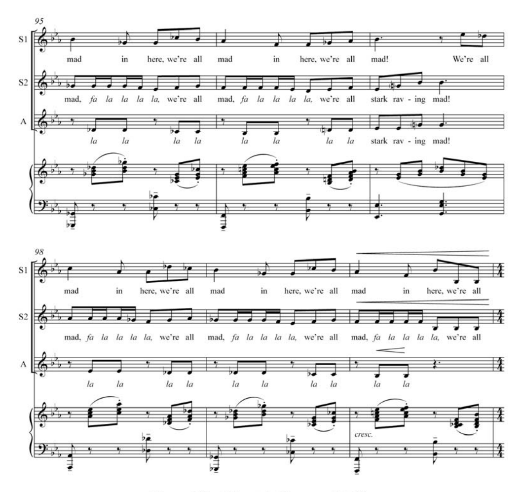
Figure 6. Sarah Quartel, Alice , mm. 95–100. © 2013 by Oxford University Press. Reproduced by permission.

follows: "God will give orders to his angels about you." (Figure 7) The vocal texture thickens and the lyricism of the text unfolds. Midway through the movement, the piece shifts into a catchy, swinging style, enhanced by the rhythn of the djembe. The second sopranos (or altos in SATB) take on a prominent role to carry the message of the text: "Faith like a child can hear the song that falls on ears of those who wait like a child for peace to come..." (Figure 8) The movement builds steadily in intensity, culminating in a ten-measure groove of unaccompanied four-part harmony: "Sweet child, hear my song, I will show you how to love."