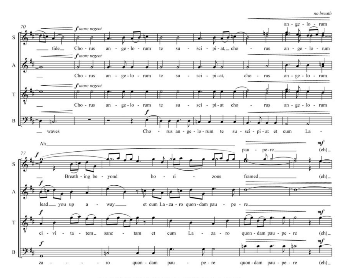
Figure 2. Kathleen Allan, In Paradisum , mm. 70–81. © 2008 Cypress Choral Music. Used by permission.