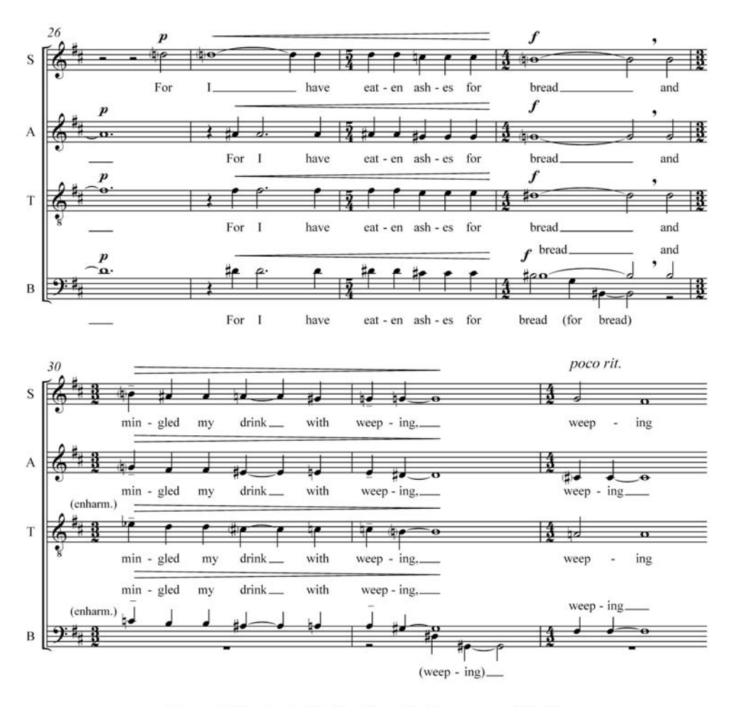
Figure 9. Stephanie Martin, Hear My Prayer ; mm. 26–32. © 2009 Cypress Choral Music. Used by permission.

"But Thou O Lord shall endure for ever and ever" is the assuring text of the contrasting second half of the piece, set in F# major. The phrase is repeated four times, with gradually increasing intensity, both in dynamic level and in the increased expanse of the four-part texture as sopranos soar to the top of their range into the final section, marked maestoso . (Figure 10) Here, the text "forever and ever" is repeated again and again, subtly referencing the minor key but ultimately ending in F# major, moving to an understated but deeply powerful close.