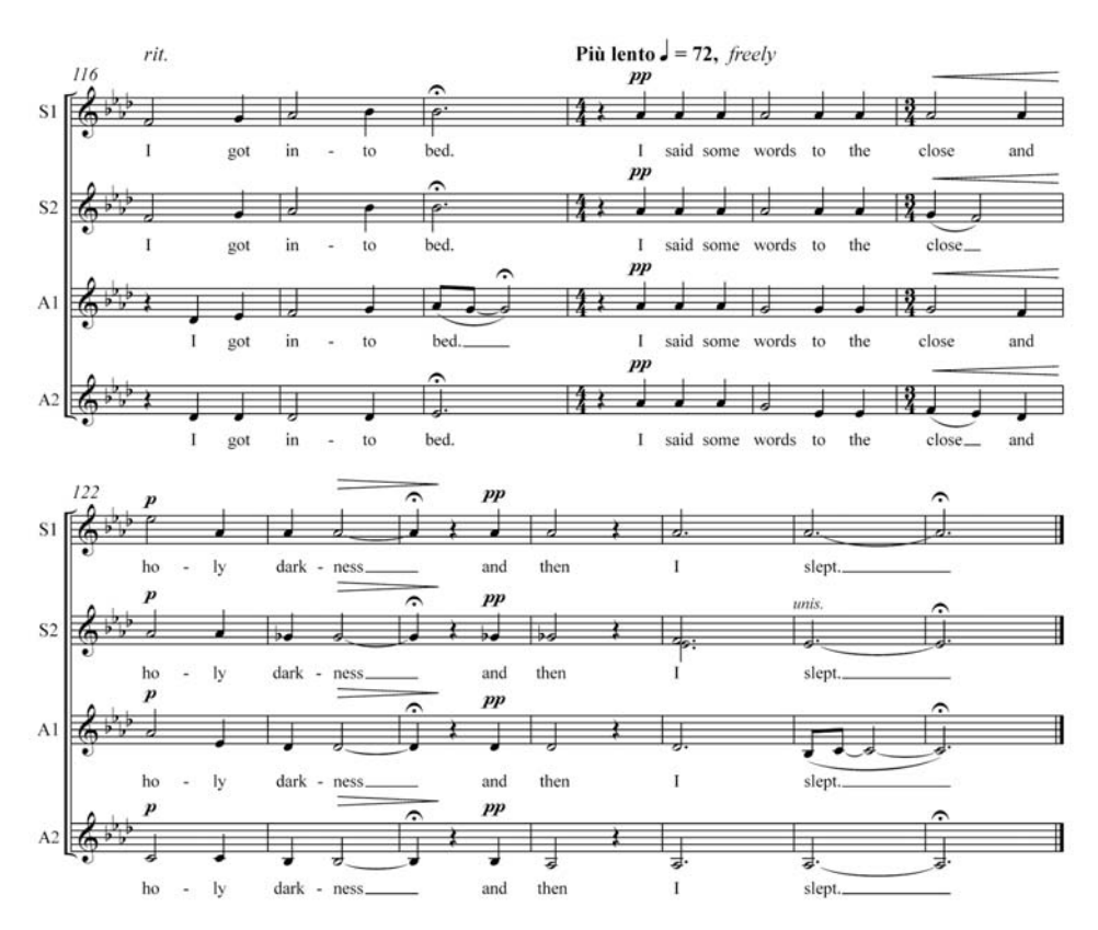
Figure 4. Kathleen Allan, The Close and Holy Darkness , mm. 116–128. © 2012 Kathleen Allan. Used by permission.