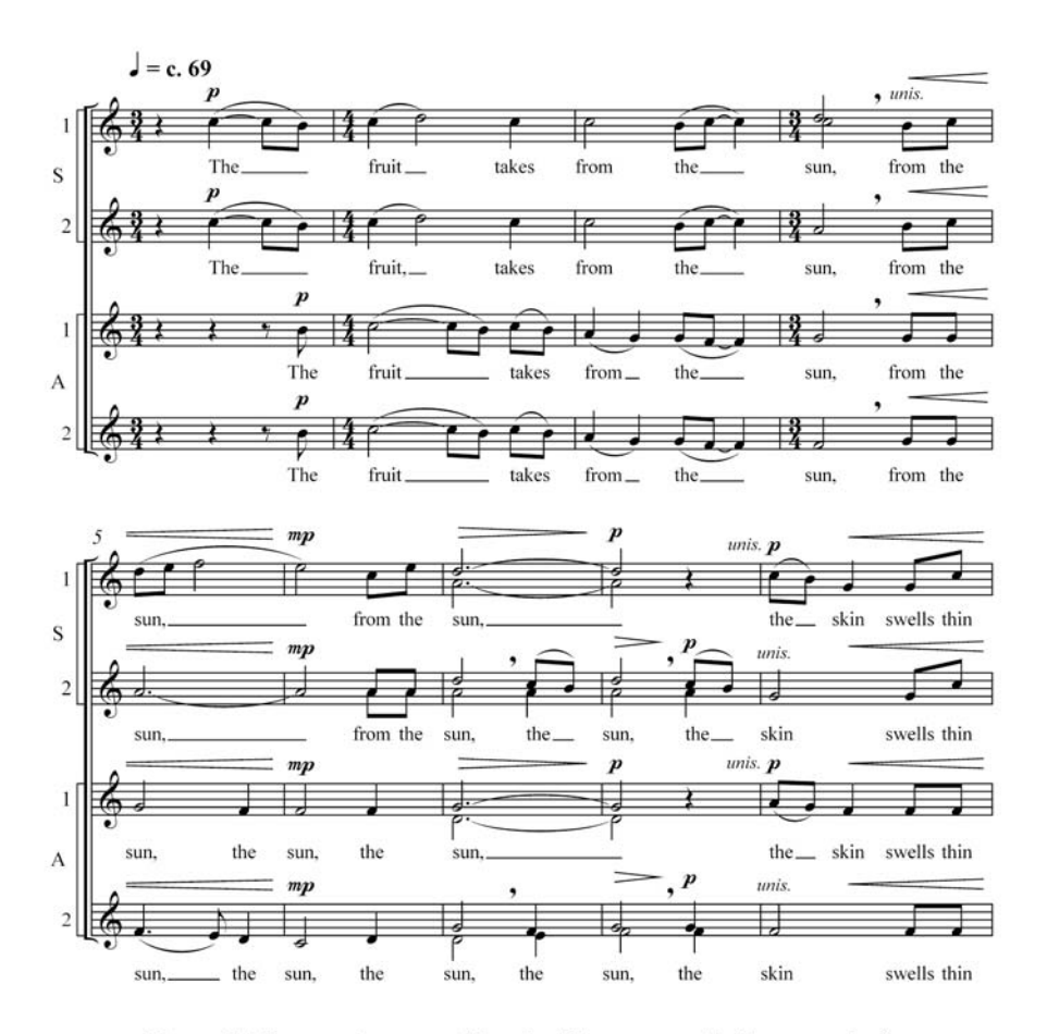
Figure 15. Ramona Luengen, How the Blossoms are Falling , mm. 1−9. © 2014 Cypress Choral Music. Used by permission.

(Figure 15) Other forms of text painting abound, with wonderfully illustrated phrases, such as: "the skin swells to green, swells to red, swells to ripeness"/ "the wind thuds and seeds the earth" / "the rich brown soil receives the flight down"/ or "the blossoms are falling." Luengen masterfully supports the text with a musical language that strengthens the power of the message. A most poignant moment comes near the end, when the choir, singing in unison, signals the end of the journey: "and to walk at that moment in the orchard once again." (Figure 16)