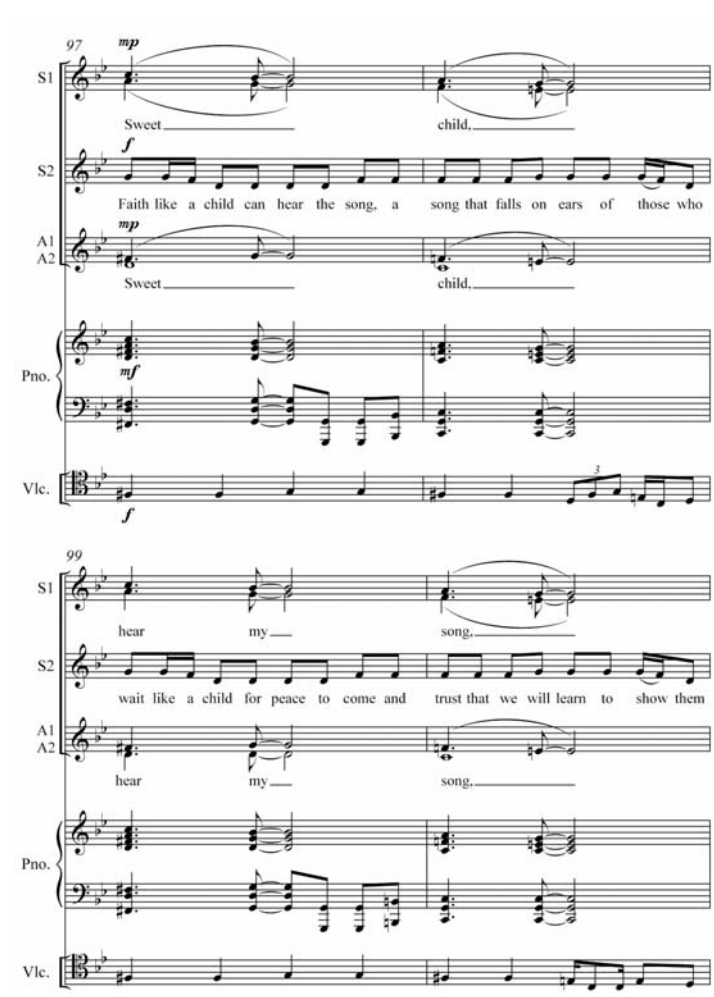
Figure 8. Sarah Quartel, Snow Angel VI, mm. 97–100. © 2002 Sarah Quartel. Used by permission.