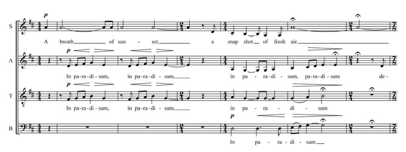
Figure 1. Kathleen Allan, In Paradisum , mm. 1−6. © 2008 Cypress Choral Music. Used by permission.