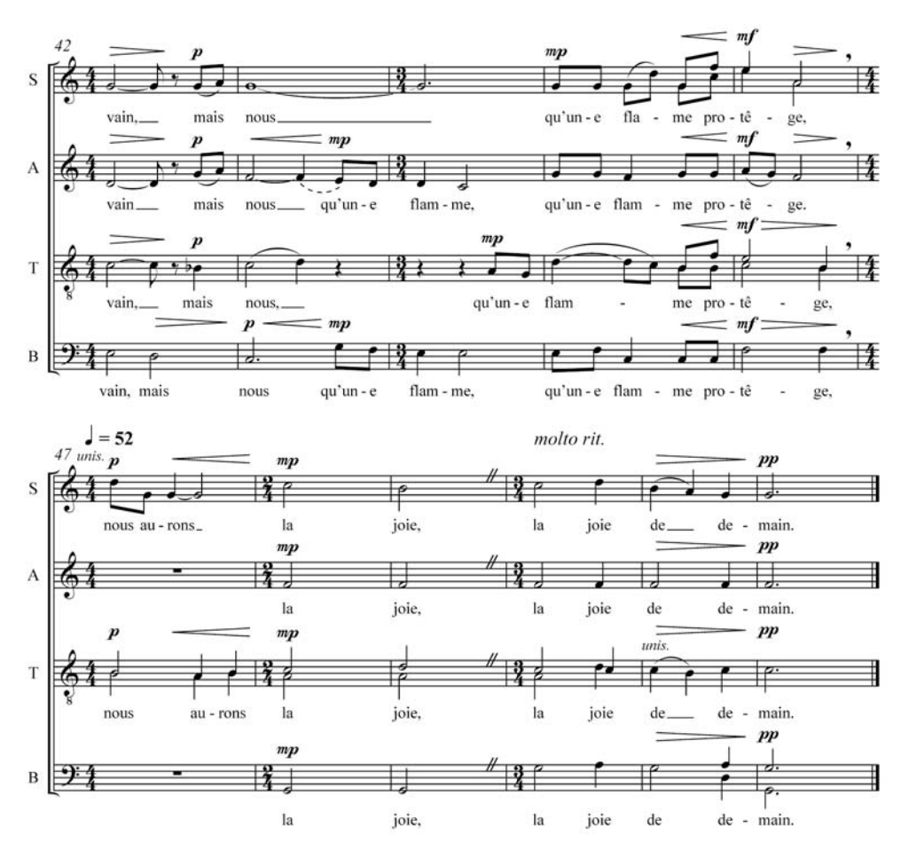
Figure 14. Ramona Luengen, Mésange , mm. 42–52. © 2013 Cypress Choral Music. Used by permission.

"How the Blossoms are Falling" was commissioned in honor of the late Diane Loomer on the occasion of her retirement from the internationally acclaimed Ele-