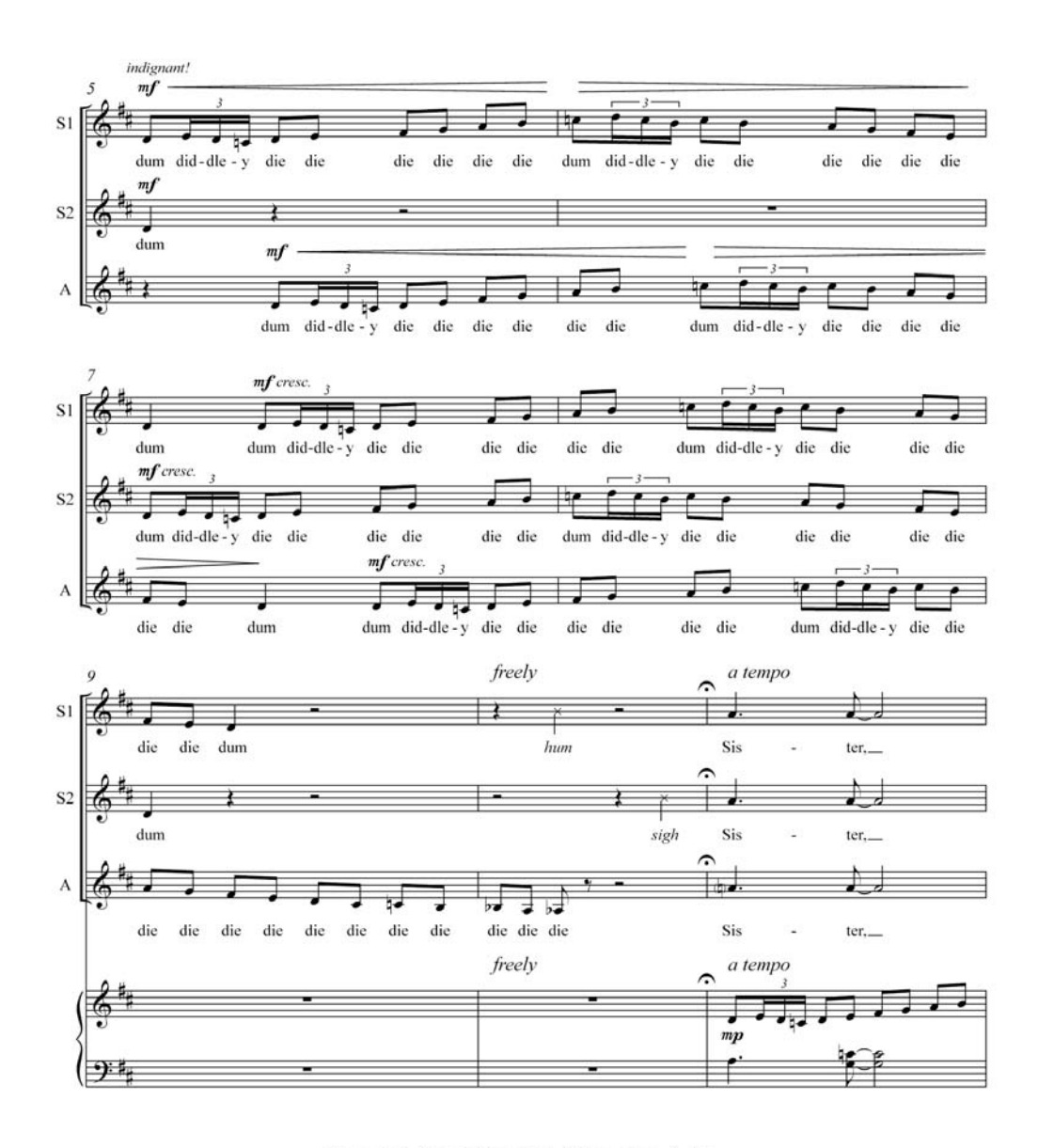
Figure 5. Sarah Quartel, Alice , mm. 5–11. © 2013 by Oxford University Press. Reproduced by permission.

Snow Angel is an extended five-movement work accompanied by piano, cello, and djembe. Versions are avail-