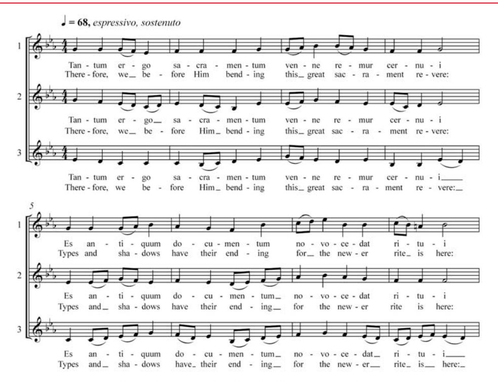
Figure 11. Stephanie Martin, Tantum Ergo , mm. 1−8. © 2012 Cypress Music, Used by permission.

the four remaining voices, one by one. Upon the entry of the fifth voice part, the textual buildup is reversed with a gradual removal of each part, ending with the exquisite opening unison melody. (Figure 12)